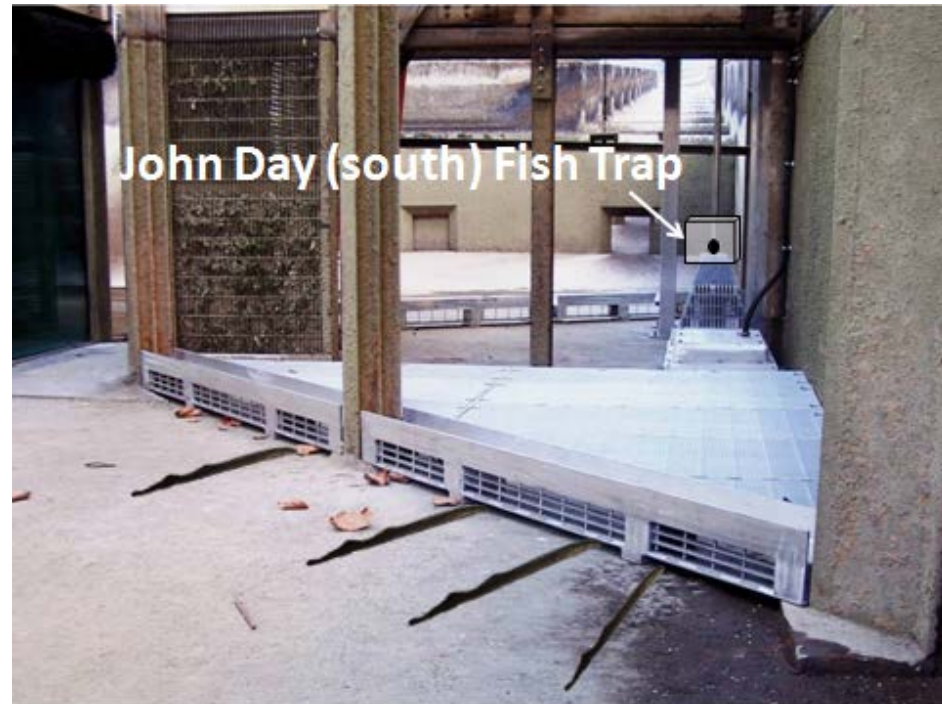
Figure 2 illustrates Oregon side adult lamprey fish trap.